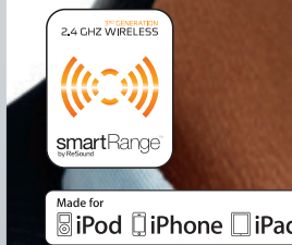
ReSound LiNX TS™ RIE 61 ReSound LiNX™ BTE 77 ReSound LiNX™ BTE 88